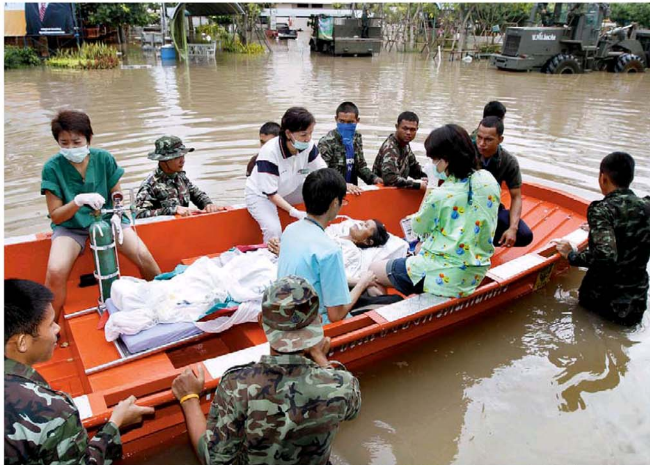
Hospital staff and soldiers help evacuate a patient from flood-hit Maharat Hospital in Nakhon Ratchasima's Muang district. Several patients were transferred yesterday to public-run Khon Kaen Hospital in the neighbouring province as the flood waters show no sign of receding. SAROT MEKSOPHAWANNAKUL