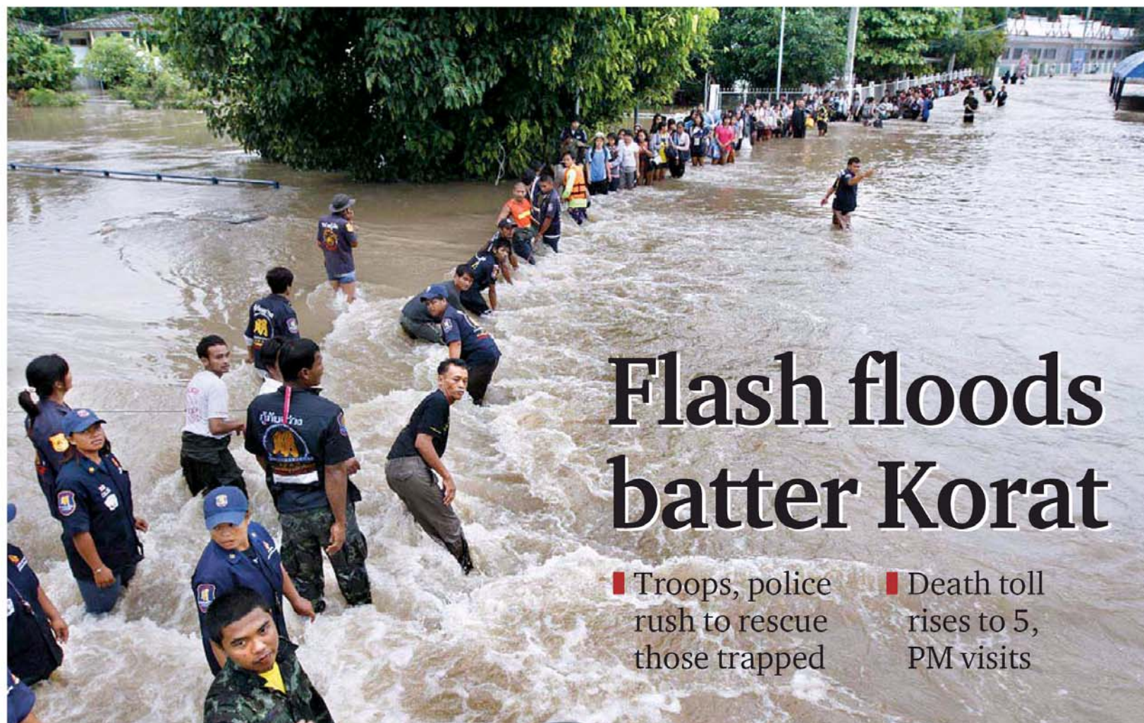
Rescue workers and soldiers use a long rope yesterday to evacuate flood victims from Maharat Hospital on Chang Puek Road in Nakhon Ratchasima's Muang district as floodwaters inundate the hospital. SAROT MEKSOPHAWANNAKUL

Motorcycle taxi drivers get first-aid training. Outlook, 01